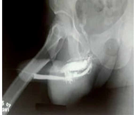
Figure 3 - The figure shows a uretrocystography of a patient with penile fracture and urethral injury.

recover normal micturition function. The treatment consists of tension-free end-to-end anastomosis under a transurethral catheter. A circular subcoronal incision followed by further penile degloving is the best described surgical approach, allowing good exposure of the corpus cavernosum and urethra, besides identification and repair of any concomitant urethral injury (9). The corpus cavernosum is treated using interrupted 3-0 polyglactin sutures. Partial urethral tearing is primarily treated with simple 5-0 polyglactin sutures over an 18 French catheter. In cases of complete urethral injury, the treatment consists of tension-free end-to-end anastomosis after sufficient dissection of the urethra on both sides of the tear (8, 19). The postoperative duration of urethral catheterization depends on the complexity of observed lesions. Generally, the urethral catheter is left for 10-14 days in cases of partial injury and for 14-21 days in cases of complete lesion (8). Some authors recommend suprapubic cystostomy in cases of complete circumferential rupture. They believe that it is safer to place a suprapubic catheter and recommend keeping it closed for at least 3 days after urethral catheter removal to ensure adequate and normal voiding before its removal (4).