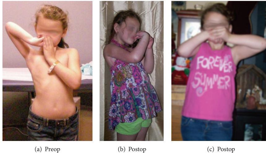
FIGURE 3: Functional movement picture of the patient after multiple surgeries at an outside hospital but before triangle tilt surgery (a) and 2 months after triangle tilt surgery (b), showing improvement in hand to mouth movement.