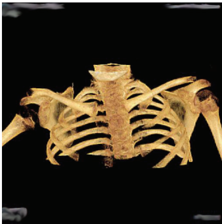
FIGURE 4: Radiological picture of the patient after multiple surgeries at an outside hospital but before triangle tilt surgery, showing SHEAR deformity [25].