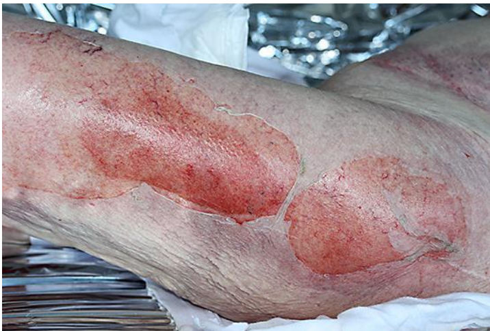
Fig. 1. Photo showing 'wet cigarette paper' skin condition on the lower extremities.