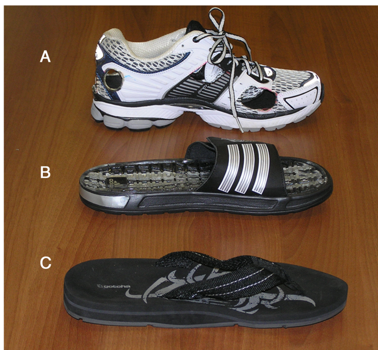
Figure 1 Footwear used in the study: A) running shoe, B) flip-flops and C) sandals.