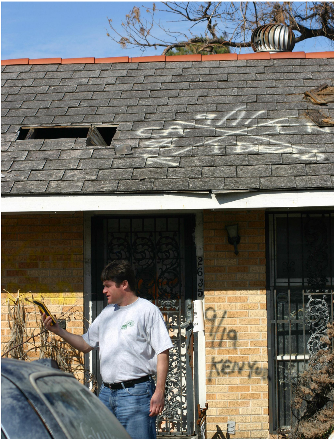
Figure 1 Hurricane Katrina search and rescue marking. This house displays the typical search and rescue "X". A California task force visited the house on September 11 th and they found "I dead". "Kenyon" removed the body on September 19 th . The field team member is seen in front of the house marking its location with a GPS.