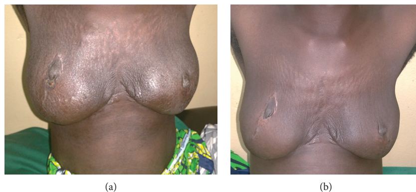
FIGURE 3: (a) Aesthetic result at 2 months (minimal lymphangitis). (b) Aesthetic result at 18 months.

exposes to risk of recurrence in some rare cases that have been described [5]. We opted for this plastic surgery on a patient who rejected bilateral mastectomy despite counseling concerning the risk of recurrence even though she did not desire future pregnancy. Using the inverted T method for mammary reduction with conservation of the nipple-areolar complex, we first proceeded by resection of the mammary gland guided by the average volume desired to remodel. Conservation of NAC was not important since it has been destroyed by the ulceration. Glandular remodeling with a superior pedicle after cutaneous flap lifting was realised to get sufficient curve.