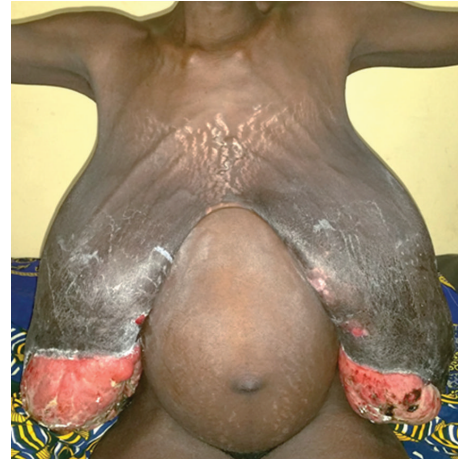
FIGURE 1: Bilateral giant breasts at 32-week gestation, with collateral venous circulation and trophic changes marked by the necrosis of the distal third of the mammary skin involving the nipple-areolar complex.

A report incriminates foetal activities as the genesis of the disease [9]. The best knowledge of this benign pathology helps in reassuring the patient and in initiating treatment modalities. It is certainly better to exclude an obvious breast cancer (on one or both sides) or an underlying cancer [3]. This is done by minimal morphological investigations, e.g., ultrasound scan or MRI of the breast, and eventually by an incisional biopsy of the lesions or fine needle aspiration biopsy guided by USS result [8]. Except local treatment to avoid superimposed infections, analgic, and psychotherapy assistance, specific treatment of this gestational gigantomastia remains controversial [2, 3, 4, 6, 7, 13–15]. Medical treatment with bromocriptine has unanimously proved to be inefficient. Spontaneous resolution has been noted in some minor cases [4, 13]. But this particular case was at the limit of a spontaneous mastectomy with a significant loss of cutaneous substance at the distal 1/3. The nipple-areolar complex was necrotic. After 21 days, there was no tendency to regression. But the weight of the ulcerated breasts caused a permanent embarrassment and repeated dressings. The surgical indication was decided since pregnancy, in front of the extent of skin loss and progressive glandular necrosis. The delay we have given has allowed to decrease the milky surge by physical means and the use of bromocriptine. Of course, there was no breastfeeding, the baby was bottlefed.