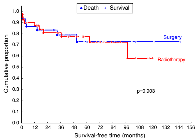
Figure 3 Overall survival.

However, Pontes et al. 18 followed 43 patients with T1a and T1b laryngeal carcinoma submitted to an initial treatment with radiotherapy and observed a high recurrence rate in 30.2% of patients after a mean follow-up time of 29.5 months. In the present series, it was observed that