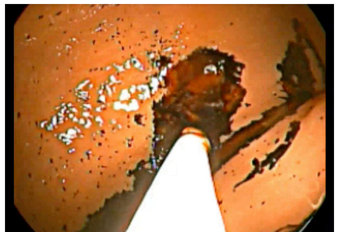
Figure 2 Congo red changes its colour from red to dark blue or black in an acidic environment.

While performing the routine OGD, the following sequence of steps are taken. The physician inserts a gastro-scope into the patient's upper digestive area to check the mucosa of the stomach and duodenum to determine if there are cancerous or non-cancerous lesions. A small tube is then inserted through the instrument channel of the gastro-scope to protrude into the stomach area. A 10cc syringe containing Congo red paint is sprayed through the rubber tube on the gastric mucosa in the body of the stomach. Through visual identification, any colour change of the gastric mucosa is identified. The diagnostic criterion for AC is no change in the colour of Congo red ( figure 1 ). If Congo red is exposed to acidic conditions, the colour will change from red (pH 5.0) to dark blue or black (pH 3.0) ( figure 2 ; online supplemental videos 1 and 2 , respectively).