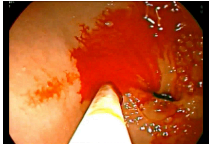
Figure 1 Congo red does not change its colour because there is no acid on gastric mucosa.

This study conducted a large single-centre retrospective examination of medical records of patients that underwent OGD at Vichaiyut Hospital in Bangkok, Thailand from January 1998 to December 2019. Inclusion criteria were patients undergoing successful OGD by means of various indications and staining of gastric mucosa with Congo red. Exclusion criteria were patients taking either a proton pump inhibitor or histamine receptor antagonist within 2 weeks before the procedure. For patients with positive Congo red results, researchers conducted a comprehensive review of patient data including the results of the OGD, results of gastric mucosa staining and clinical background information. The data were then