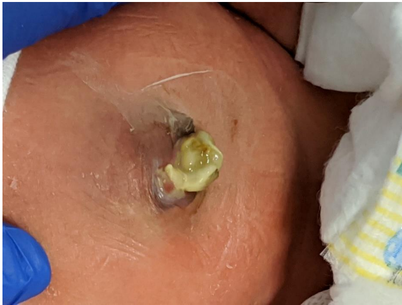
Figure 4. The infant shown in Figure 1 underwent a primary sutureless closure soon after birth. Shown at 19 days of age, he is on full oral feeds.