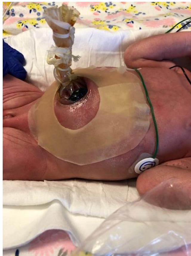
Figure 3. Staged reduction of gastroschisis. Shown is a picture with the bowel loops reduced into the abdomen using a silo.