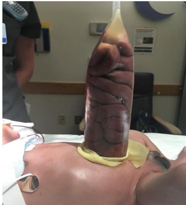
Figure 2. Staged reduction of gastroschisis. Shown is a picture with the bowel loops placed in a silo.