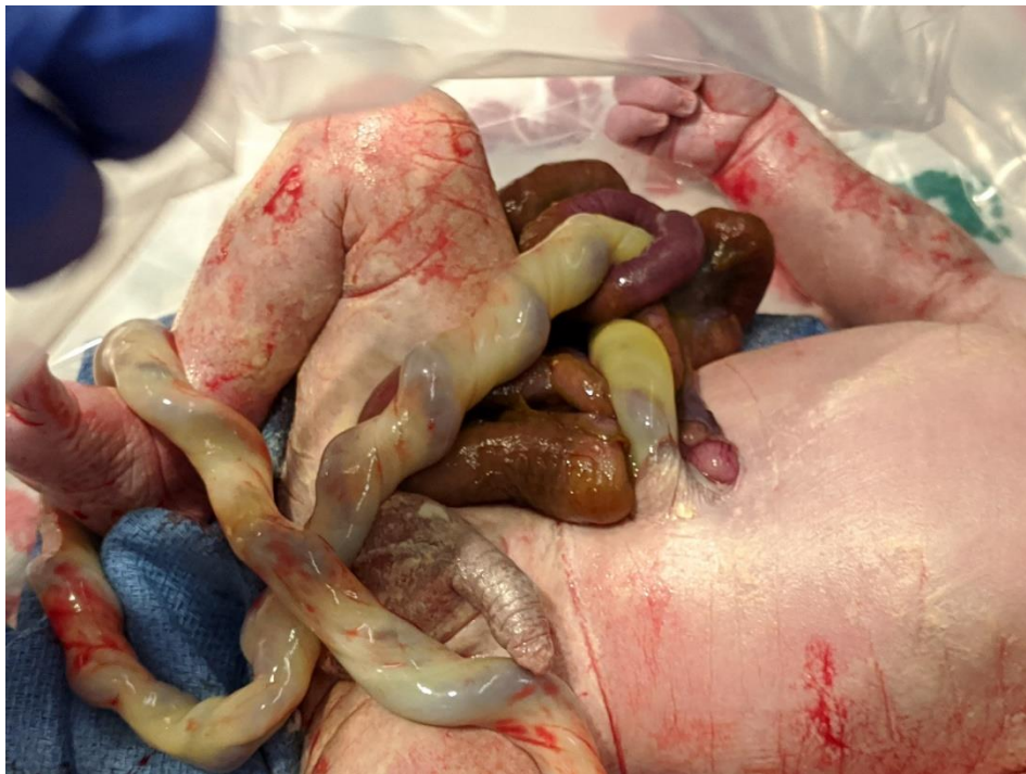
Figure 1. Term infant with simple gastroschisis. The picture shows a small abdominal wall defect to the right of the site of umbilical cord insertion.

The International Clearinghouse for Birth Defects Surveillance and Research defines gastroschisis (Figure 1) as “a congenital malformation characterized by visceral herniation usually through a right side abdominal wall defect to an intact umbilical cord and not covered by a membrane” [3]. Approximately 10% of infants with gastroschisis have intestinal stenosis or atresia [4] resulting from vascular insufficiency due to a volvulus or compression of vascular pedicle by a narrowing abdominal ring [5].