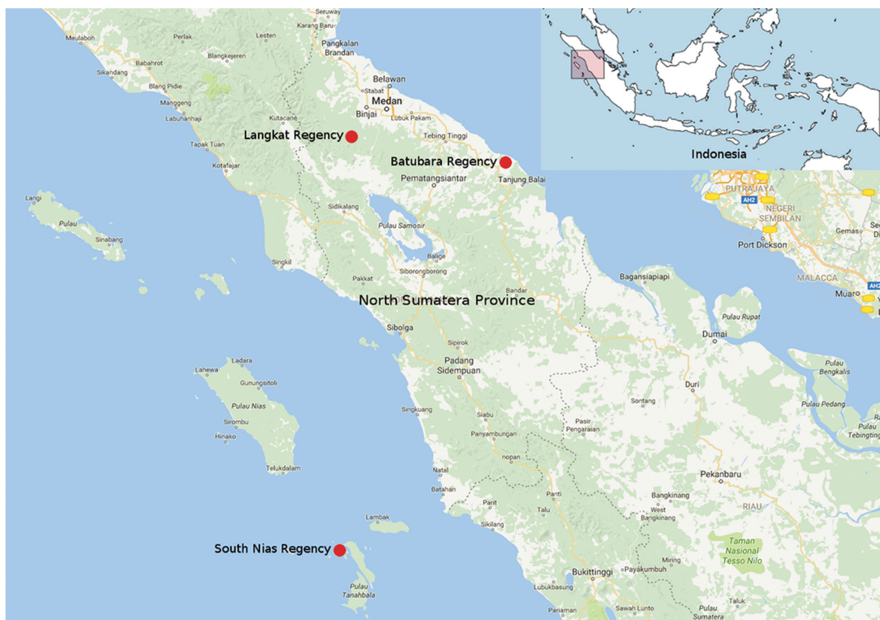
Figure 1. Map of North Sumatera province, Indonesia. The 3 studied regencies (Batubara, Langkat, and South Nias) are indicated.

Sampling strategies differed among the 3 sites, owing to contrasting geography and inconsistencies in access to health facilities. In Batubara, most communities had good access to a health clinic, which was open to patients from 8 am to noon, 6 days per week. We established a 24-hour, 7-day clinic for an 8-week period of screening, after intensive health promotion and education on malaria and sensitization concerning to our study objectives. This sensitization was facilitated by local leaders and carried out at the level of the whole community, but clinic attendance was entirely voluntary. Thus, sampling was not designed to reach the whole community. Local health clinics were also