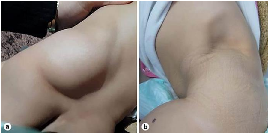
Fig. 1. Clinical examination of the patient. a A well-defined soft tissue mass in the left lumbar region. b Reduction of the mass revealed a huge defect involving all layers.