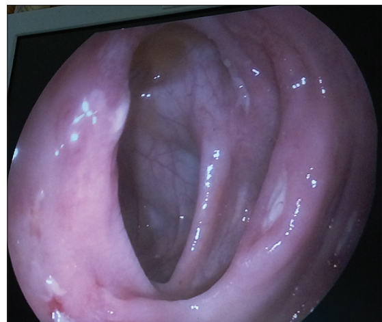
Figure 3: Healing ulcers in the colon

evaluated by series of questions, dry mouth by estimation of unstimulated salivary flow rate. Periodontal status was assessed by gingival and periodontal index. All the above parameters were assessed in diagnosed UC