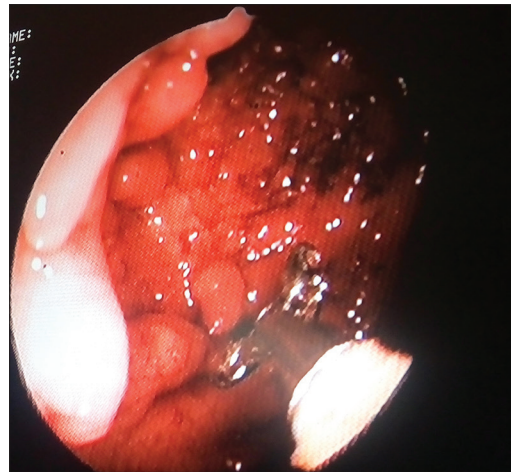
Figure 1: Multiple pseudopolyps with mucosal ulcers in the colon

From the review of various studies and personal experience of oral manifestations of UC, a detailed case history format was prepared that included patient evaluation for PV, aphthous ulcer, lichenoid lesion, tongue coating, halitosis, dysgeusia, dry mouth, gingivitis and periodontitis. PV, aphthous ulcer (composite index), [7] lichenoid lesion, tongue coating (Miyazaki et al. 's index) [8] were assessed by clinical examination. Halitosis and dysgeusia were