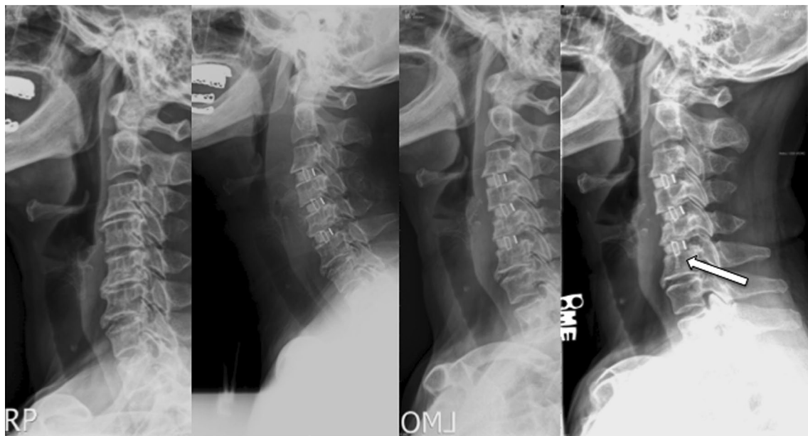
Fig. 3 Example of interbody cage subsidence in a patient who underwent a three level discectomy. Left to right preoperative, postoperative 1, 6, 12 months

transition force between the cage and the vertebral bodies, for example PEEK, carbon fiber and trabecular metal cages [2, 5–7, 9, 30].