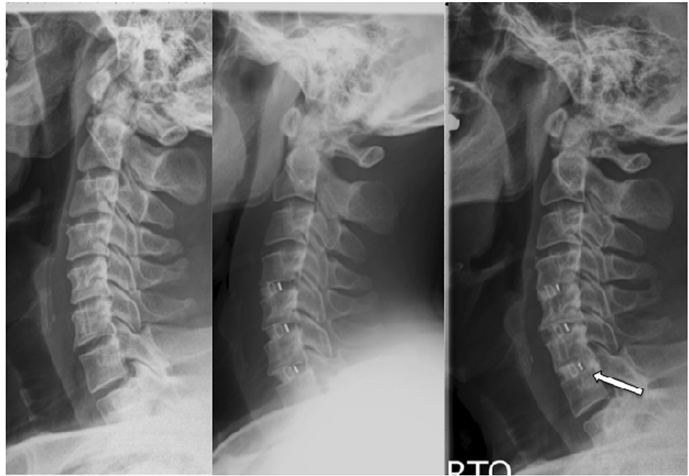
Fig. 2 Example of fusion through the interbody space in a patient who underwent a three level discectomy. Left to right preoperative, postoperative 1 and 6 months