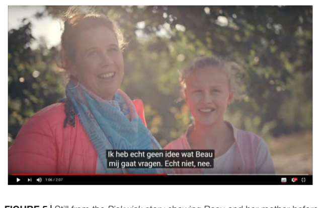
FIGURE 5 | Still from the Pickwick story showing Beau and her mother before the critical event, looking into the camera and the mother talking into the camera. [Literally: "I really have no idea what Beau is about to ask me. Really not, no." ]

Throughout a story, evaluations can be used that signify the character's or the narrator's comments on the events. Evaluations are typically quotations expressing personal experiences (Labov, 2010), such as the emotional impact of the story events or the considerations taken into account when facing a dilemma. The critical event of the Pickwick story is preceded by an evaluation (see Figure 5 ). This evaluative scene shows Beau standing next to her mother, both looking in the direction of the camera, with the mother stating she has no clue what her daughter is up to. Such evaluations, spoken outside the kernel narrative, serve to facilitate the viewers' identification with particular narrative characters' experiences – typically extraordinary or impactful experiences that justify the story to be told (cf. Bell, 1995; Labov, 2010). This will be elaborated in the next section.