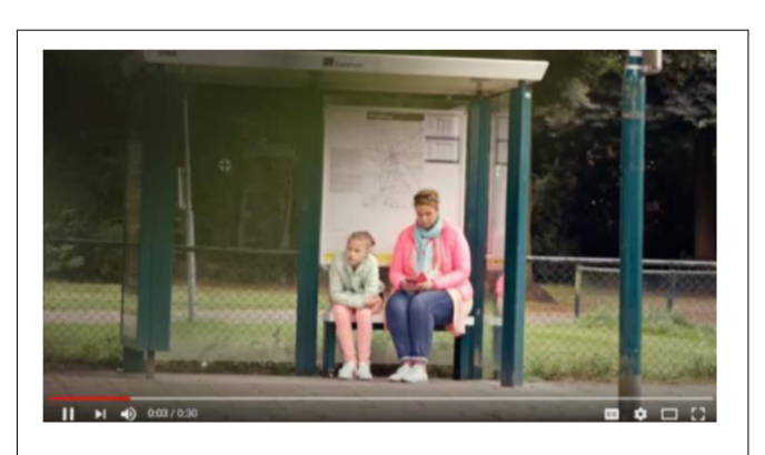
FIGURE 7 | Still from the Pickwick story showing Beau sitting next to her mother at a bus stop.