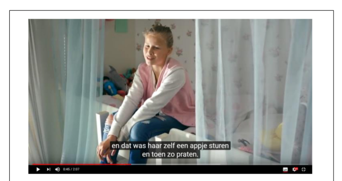
FIGURE 6 | Still showing Beau talking to an invisible interlocutor in her bedroom, telling that the only way to reach her mother was [Literally: "to send her an app and talk to her that way" ].