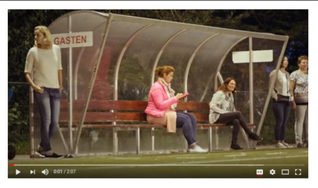
FIGURE 1 Start of the Pickwick story showing the mother occupied with her smartphone. <sup>2</sup>