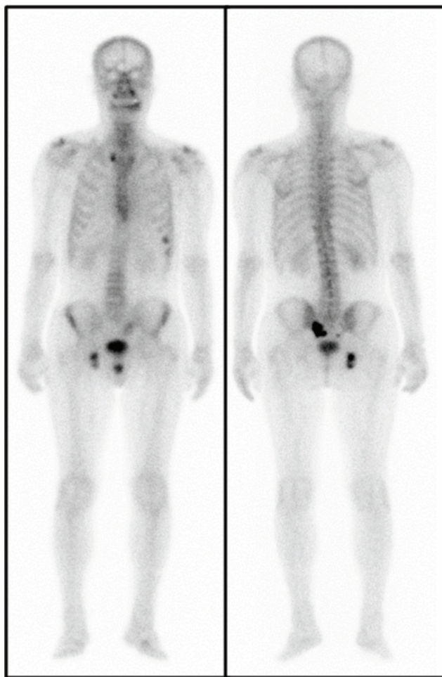
Figure 1. A 71-year-old male diagnosed with PV in 2000 and PCa in 2013 was referred to our hospital. After radical prostatectomy, the Gleason score was 8 (3+5) with pT3b-R1 staging. In 2014, RT on the prostatic region was performed, and subsequently systemic treatment was introduced. Treatment with hydroxyurea for PV (500 mg for 5 days, 1000 mg for 2 days, per week) had also been administered. Radium-223 was administered according with the current EANM guidelines. Before the first administration, a technetium-99m -HDP bone scan was performed, depicting an oligometastatic disease. An interim bone scan was obtained after the third administration and a further one after the sixth at the end of treatment. Follow-up bone scans at 3, 6, and 12 months after the end of Radium-223 treatment was carried out.

Patients with mCRPC with compromised bone marrow reserve due to previous therapies have an increased risk of hematological AEs when enrolled in the Radium-223 treatment (4). Although the occurrence of anemia and neutropenia were not significantly different between placebo and the Radium-223 group in the ALSYMPCA trial (5), the cumulative effects of Radium-223 and other chemotherapies remain unelucidated.