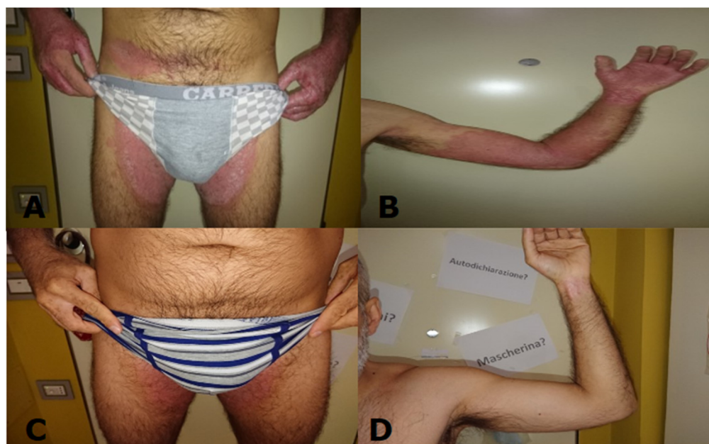
Figure 1. (A) Patient at baseline genital area; (B) patient at baseline left arm; (C) patient after one year, genital area; (D) patient after one year, left arm.

During the first follow-up visit, three months after the beginning of treatment, cutaneous lesions were dramatically improved (PASI 5). After six months, another complete blood panel was performed. Creatinine dropped to 1,0 mg/dL, and therefore a GFR exam was performed; results showed a filtration rate of 95 mL/min, corresponding to a stage-one renal failure. After one year of anti-interleukin 17 therapy, at the third follow-up visit, the patient's skin clearance was almost complete (PASI 1), and creatininemia was still 1.0mg/dL (Figure 1).