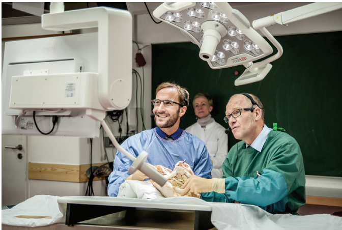
Figure 5. Live demonstration of formalin-fixed body donors into the auditorium of the AGE Annual Meeting in Hamburg. This figure shows the topographical anatomy in the lesser pelvis