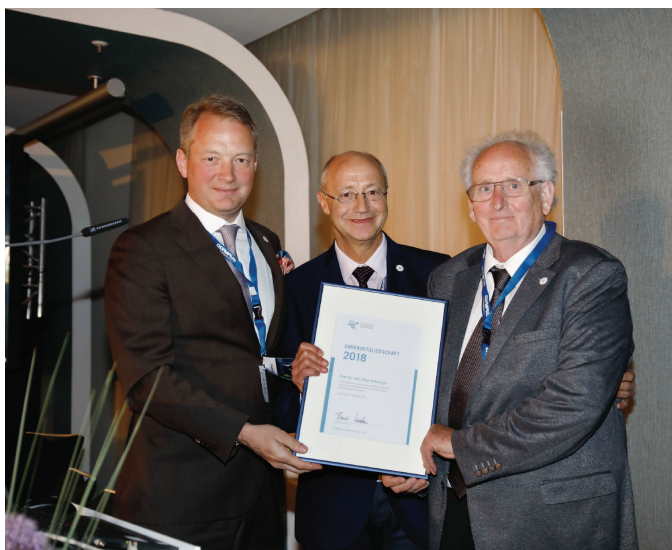
Figure 2. The president of the German Society for Gynecological Endoscopy (left) hands over the honorary membership to two laureates