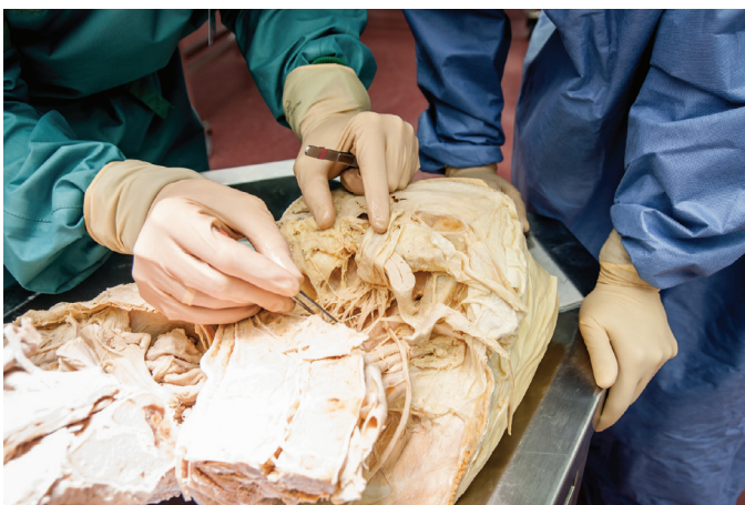
Figure 6. Live demonstration of formalin-fixed body donors into the auditorium of the AGE Annual Meeting in Hamburg. This figure shows the course of vessels in the lesser pelvis