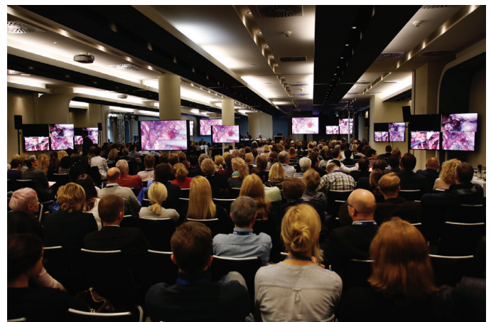
Figure 3. Impressions during the live transmission

All the same it should be noted that the benefits of training and teaching under safe medical and ethical conditions have been