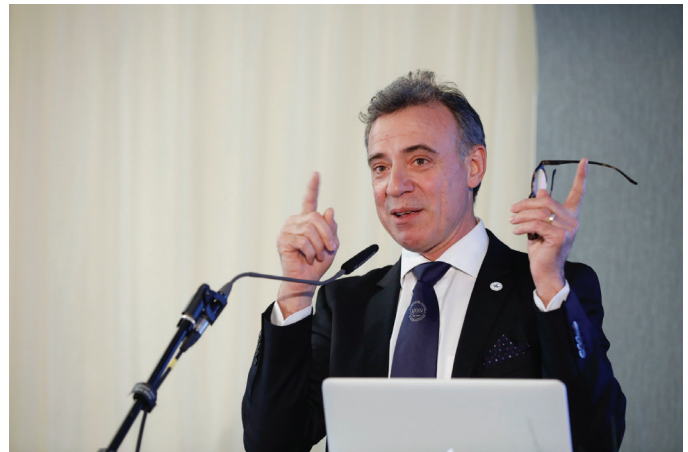
Figure 8. The pioneer and founder of the neuropelvelogy appeals to the attendees' individual sense of responsibility and the practical application of the Hippocratic Oath in our times; he raises both hands upward while doing so