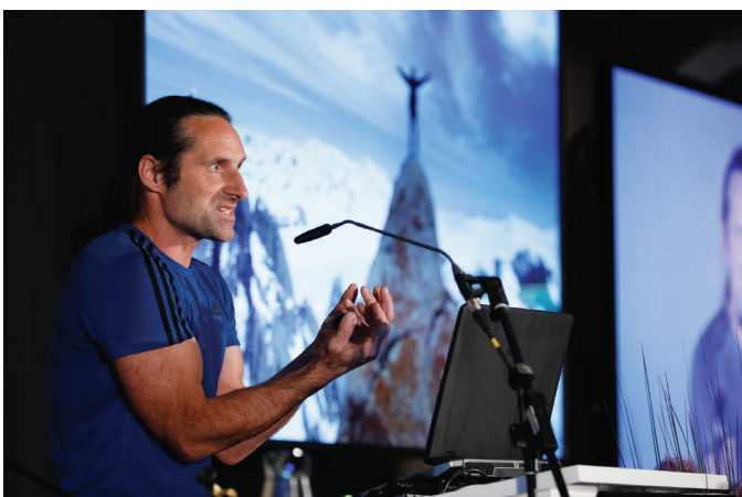
Figure 7. The German extreme climber in his element - the unification of man and mountain