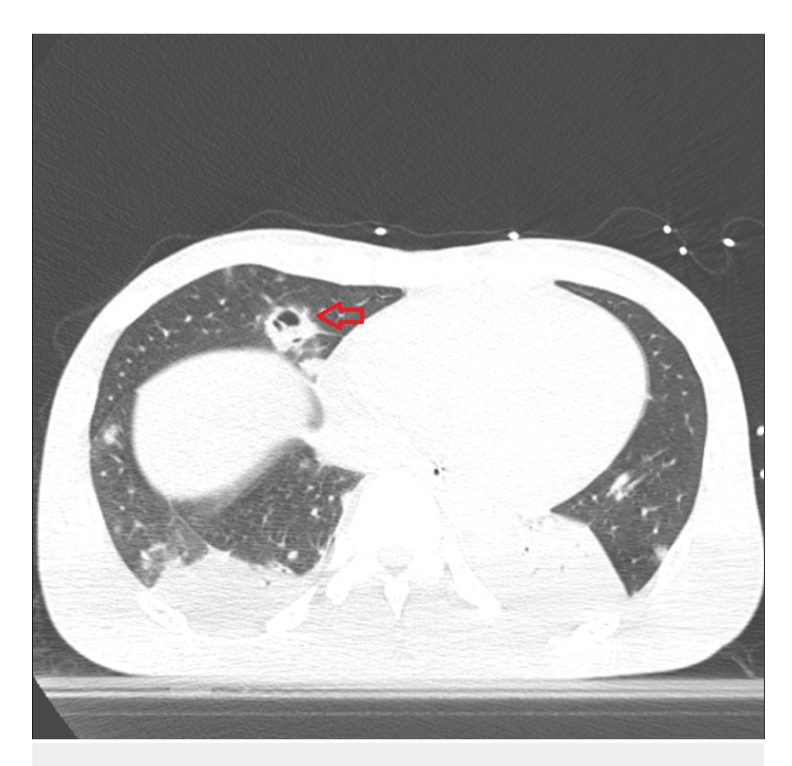
FIGURE 4: Computed tomography (CT) of the chest without contrast showing multifocal cavitary lesions seen throughout the lungs with largest cavitary lesion (read arrow) seen in the right middle lobe

Blood cultures initially obtained in the ED, and the CSF cultures came back positive for methicillin-sensitive Staphylococcus aureus (MSSA). The transthoracic echocardiogram was obtained which showed a mobile echodensity on the anterior tricuspid leaflet (Figure 5 ).