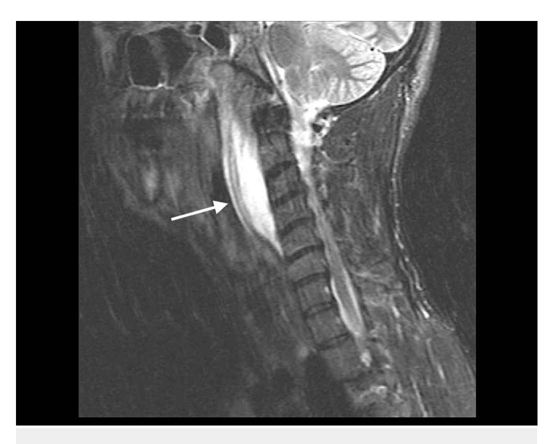
FIGURE 2: Magnetic resonance imaging (MRI) of soft tissues of the neck showing a retropharyngeal abscess (white arrow)

Magnetic resonance imaging (MRI) brain also showed focal areas of enhancement in the right caudate nucleus and left lateral pons concerning for cerebritis. Magnetic resonance venogram (MRV) showed bilateral cavernous sinus thrombosis (Figure 3).