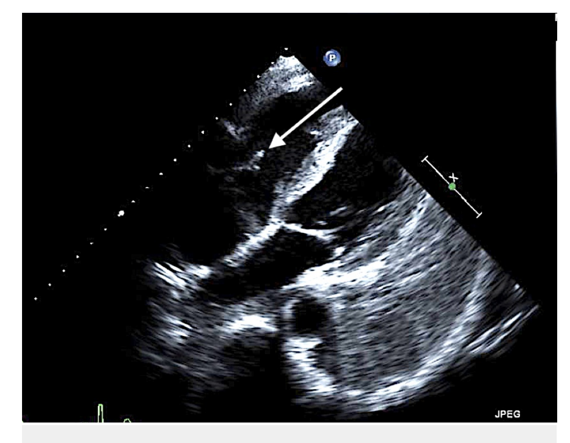
FIGURE 5: Transthoracic echo cardiogram showing mobile echo density noted on the anterior tricuspid leaflet measuring 0.9 x 0.3 cm (white arrow)

Antibiotics were switched to IV Nafcillin in the context of identification of the pathogen and for better central nervous system (CNS) penetration.