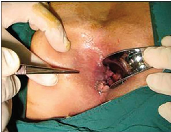
Figure 1: Superficial preanal abscess

Patients were followed weekly for 1-month, then once every 3 months for persistent fistula, recurrence of abscess and anal incontinence.