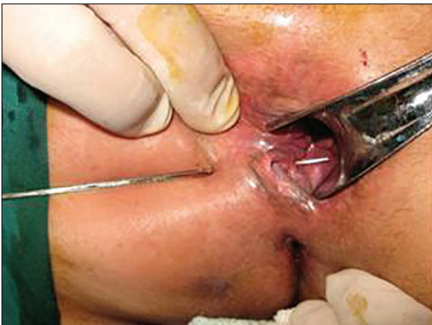
Figure 3: Probing throughout the orifice