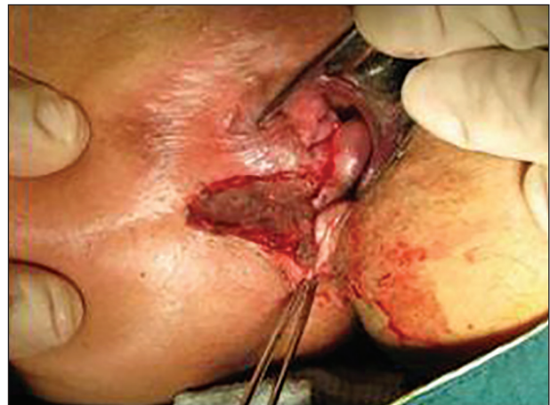
Figure 4: Laying open the abscess cavity