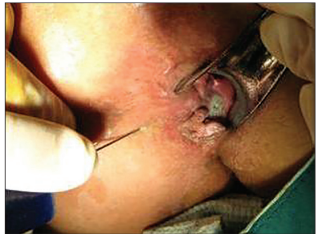
Figure 2: Finding of internal orifice