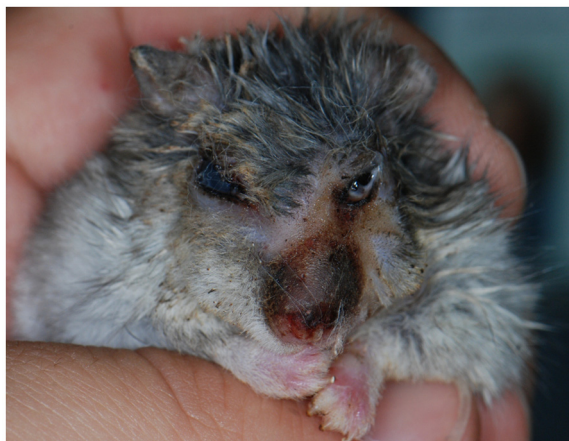
Figure 3 Photograph of a pet hamster after that fire ignited during laser surgery. Notice the spread of the lesion along the face.