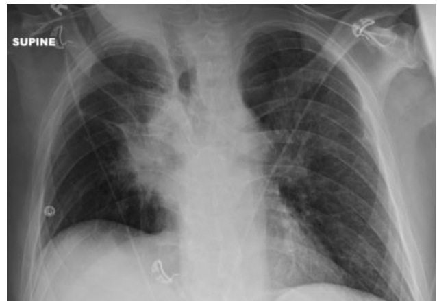
Fig. 1 X-ray image showing enlarged hilar lymph nodes.

Subsequent testing for HIV (human immunodeficiency virus) was negative. Infectious disease consultation was requested and he was started empiric liposomal amphotericin B with 5-flucytosine. Cryptococcal antigen titer from the CSF was positive at > 1:2,560, the upper limit of measurement. Culture from CSF and from intraoperative samples of sinus material isolated and confirmed Cryptococcus neoformans (►Fig. 4).