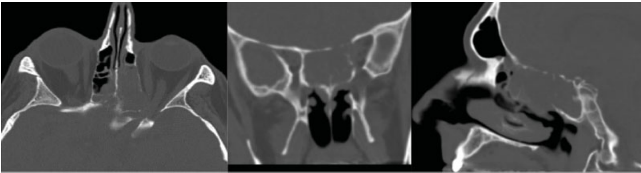
Fig. 2 Computed tomography showing opacification of the middle and posterior left ethmoid air cells, posterior right ethmoid air cells, and bilateral sphenoid sinuses, as well as the left frontal sinus, as well as bone erosion involving the medial wall of the left orbit and the roof of the ethmoid air cells and planum sphenoidale.