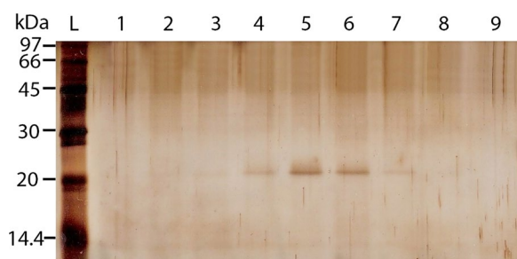
Fig. 3 Purification of S-HDAg-His 6 -tag fusion protein using nickel affinity chromatography. L indicates protein ladder; 1–9 are eluted fractions which have imidazole concentrations ranging from 72 to 156 mM (the concentration interval between 2 consecutive fractions is about 12 mM). The gel was visualized by silver staining