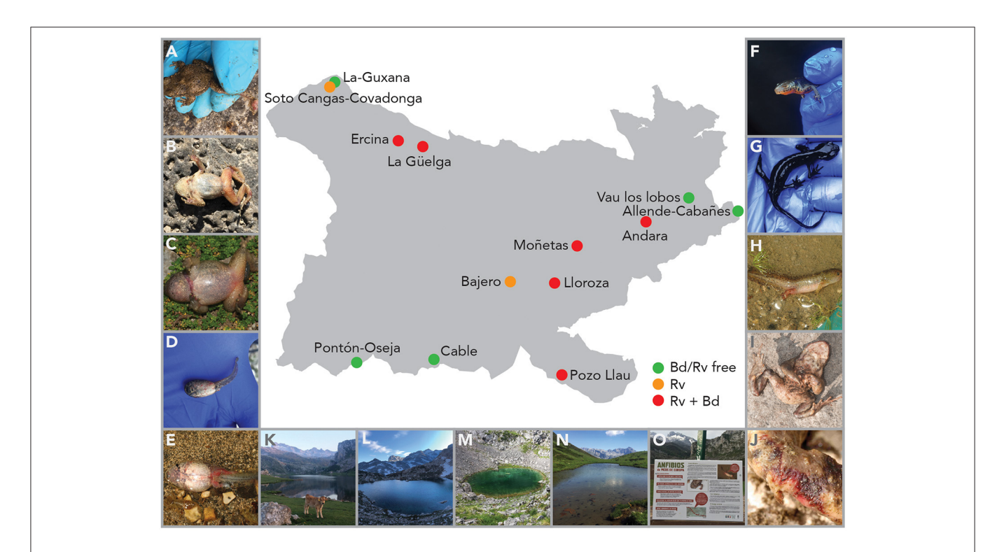
FIGURE 2 | Map of PNPE with sampling sites and signs of ranavirosis in three species. Alytes obstetricans adults with severe limb necrosis (A) or erythema (B), metamorph with erythema and swelling of the body and legs (C), and larvae with systemic hemorrhage (D, E). Ichthyosaura alpestris adults with missing eyes (F) or cachexia (G) and larvae with systemic hemorrhaging (H). Bufo spinosus adults with erythema (I) and with open lesion on the feet (J). Study locations of Ercina (K), Lloroza (L), Moñetas (M) and Pozo Llau (N), and signage to inform visitors about the presence of Rv in PNPE (O).

FIGURE 1 | Dynamics of abundance of 24 populations of PNPE estimated from 2007 to 2020. Time index 1 refers to the amphibian counts measured in 2007 (i.e., the baseline in first sampling year). Blue lines are annual abundance estimates, while red lines were established by means of TRIM models.