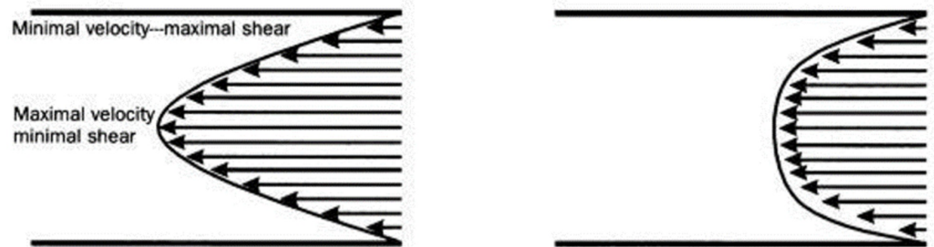
FIGURE 1: Shear rate

Hematocrit is the most powerful of the variables that determine blood viscosity. Other important variables include plasma viscosity, erythrocyte deformability, and erythrocyte aggregation (rouleaux formation). Importantly, blood viscosity is also determined by its shear rate [6]. A flowing fluid such as blood can be envisioned as an infinite number of parallel layers sliding against each other. Viscosity results from friction between adjacent layers. The shear rate of a fluid is the difference in velocity between any two layers divided by the distance between them. Viscosity is the ratio of shear stress, defined as the force applied to a fluid divided by its contact area, and shear rate (viscosity = shear stress/shear rate). In a low viscosity fluid, a small shear stress (and force) results in a high shear rate (and flow velocity) (Figure 1).