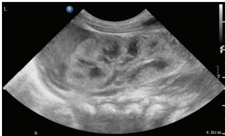
FIGURE 2: Normal looking left kidney in abdominal ultrasonography.

hypertrophy or hydronephrosis (Figure 2). Laboratory test presented creatinine level of 0.75 mg/dL proving normal kidney function. After informed consent was obtained from the patient's parents, the patient underwent a laparoscopic surgery for right orchiopexy and absence of right vas deferens and epididymis was noted (Figure 3). However, due to relatively short length of right spermatic cord structure, laparoscopic orchiectomy was performed instead of orchiopexy. The patient's postoperative histologic analysis of right testis confirmed a normal testicle with absent epididymis.