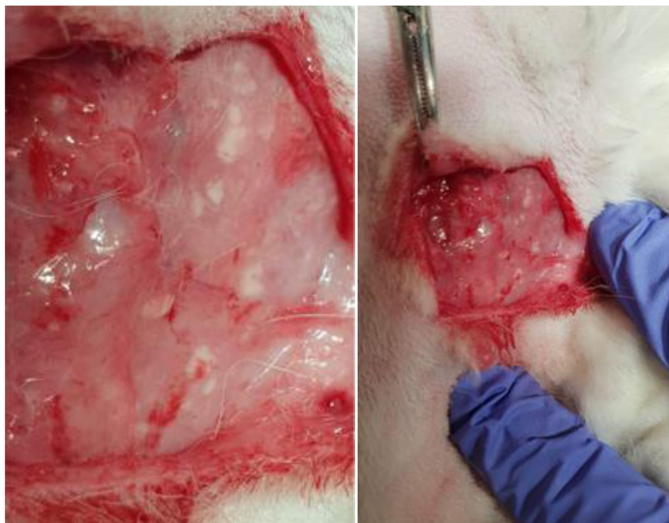
Figure 2. Multiple purulent collections arranged around the mesh, during explant removal surgery.

Blood extraction from the ear artery. Blood withdrawal from the ear artery may be a difficult procedure. Blood was obtained in 79 occasions. In 6 cases (4.74%) we experienced difficulties that led to the collection of insufficient blood volume to complete the studies. These difficulties occurred in both groups.