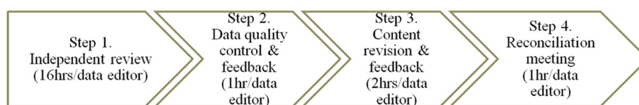
Figure 4 Workflow process for the individual data editors reviews.

Information is currently being gathered in Microsoft Excel spreadsheets. This constitutes our raw data collection. In order to produce a database that will be functional for both qualitative and quantitative data analysis, these data are then automatically extracted from Excel into a Microsoft Access database. This database records data on all the indicators listed above, in a three-