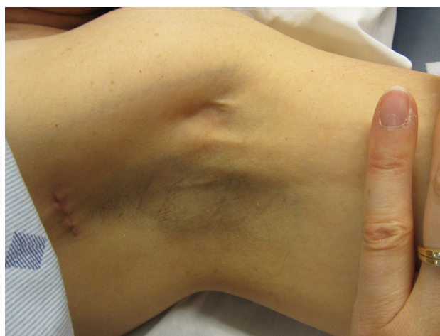
Figure 1 Axillary web syndrome of the left axilla. Note: Multiple cords are visible in the mid axilla.

Patients with less rigid or shorter cords may have minimal cord tension and minimal symptoms until they approach full extension and abduction. In our experience, they frequently describe arm movement as feeling “different” or “not nor-