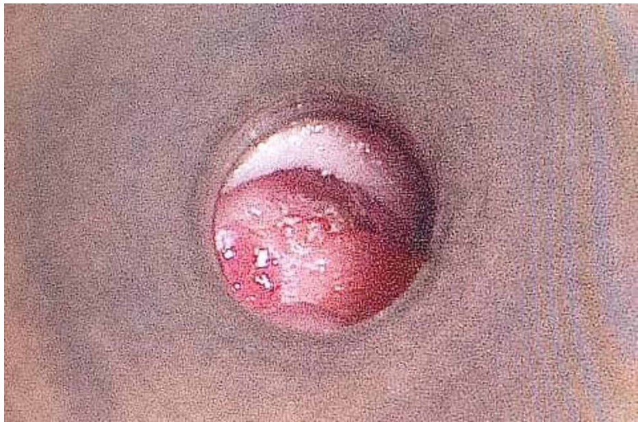
FIGURE 1: Microscopic view of the right external auditory canal.