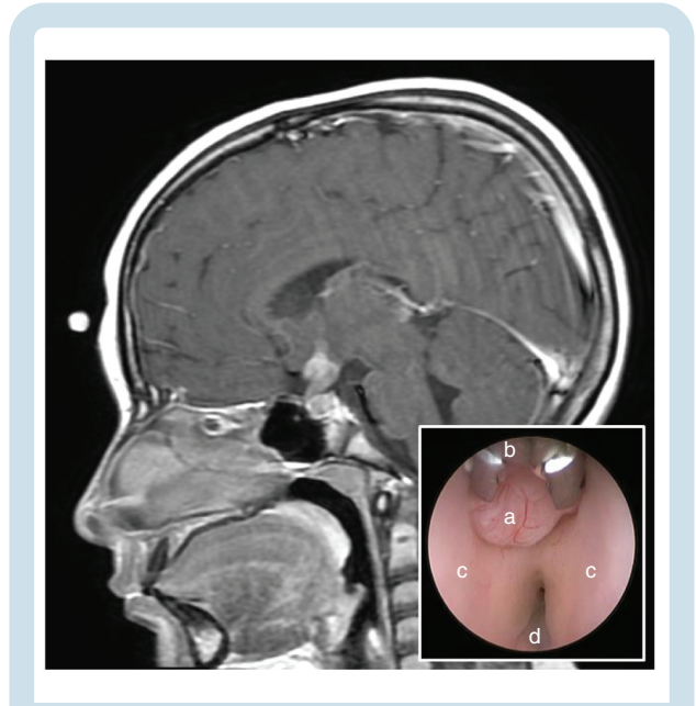
Fig. 2 Sagittal post-contrast MRI of the brain demonstrating a hypothalamic and infundibular mass in a 10-year-old female presenting with diabetes insipidus. Given normal serum and CSF tumor markers, a right frontal endoscopic tumor biopsy was performed which confirmed pure germinoma. Endoscopic view of the third ventricle (inset) revealing the exophytic tumor mass (a), 1 mm endoscopic biopsy forceps (b), and the bilateral hypothalami (c).

Surgery of the residual mass is highly recommended in NGGCT<sup>30</sup> (Figure 3). In germinoma, surgery is recommended when an associated teratoma component is suspected based on failure of the tumor to shrink during chemotherapy. The intent of second-look surgery is a safe maximal resection. When tumor progression occurs during induction chemotherapy while markers are decreasing, this usually represents growing teratoma syndrome unresponsive to chemo/radiation therapy.<sup>33</sup> It warrants a surgical excision The prognosis of these patients is usually excellent.<sup>34</sup>