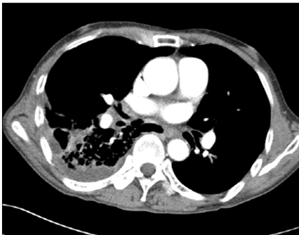
Figure 1. Chest computed tomography shows pneumonic consolidations in the right lower lobe with pleural effusion,

pulse rate was 84 beats per minute, the respiratory rate was 18/min and the body temperature was 36,5°C. The arterial blood gas analysis showed pH 7.45, PaCO 2 27,2 mm Hg, PaO 2 59,0 mm Hg, HCO 3 18,5 mmol/L, SaO 2 92,2% at room air. The laboratory test results were white blood cells (WBC) count 16,400/mm 3 , hemoglobin 13,4 g/dL, platelets 194,000/mm 3 , and C-reactive protein 32,5 mg/dL. The chest radiograph revealed pneumonic infiltration in the right lower lobe. The chest computed tomography (CT) found emphysematous changes in the lung parenchyma and consolidation in the right lower lobe with a right pleural effusion (Figure