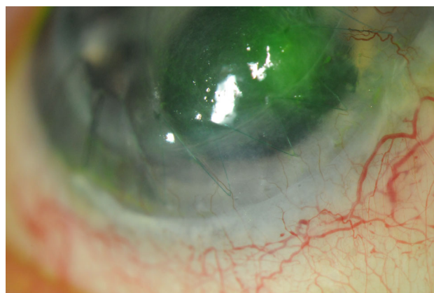
Fig. 2 Geographic corneal ulcer involving the graft-host interface