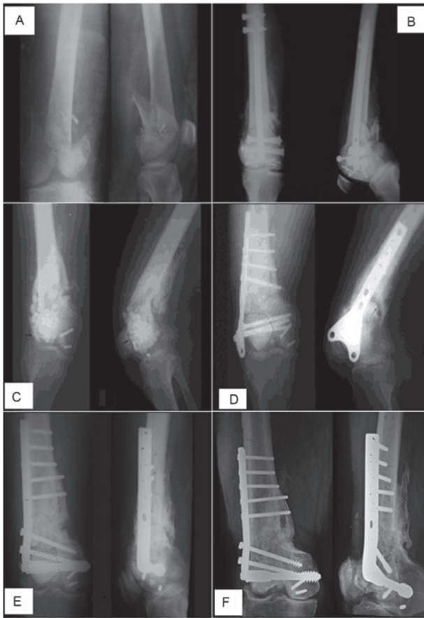
Figure 2. Postoperative infection of femoral condyle fracture. (A) Preoperative radiograph; (B) postoperative radiograph of internal fixation; (C) implantation of a vancomycin cement bead in the bone defect area (arrow) following debridement and dismantling of the internal fixation appliance; (D) implantation of a femoral condyle allograft from which the cartilage surface was removed (dotted line area) after the vancomycin cement bead had been removed and fixed by a strut plate; 8 months later, nonunion and displacement of the femoral condyle was observed (arrow indicates fracture line); (E) granulated cancellous autografting and a dynamic condylar screw plate was used to strengthen the fixation; this X-ray was produced 5 months after surgery (dotted line area indicates allograft); (F) 2 years after surgery, bone healing and existence of joint space was observed in the radiograph.

The removal time of the drainage tube was determined by the final volume of drainage (<5 ml/24 h). The average drainage times were 8 days for the articular cavity and 16 days for the bone graft area.