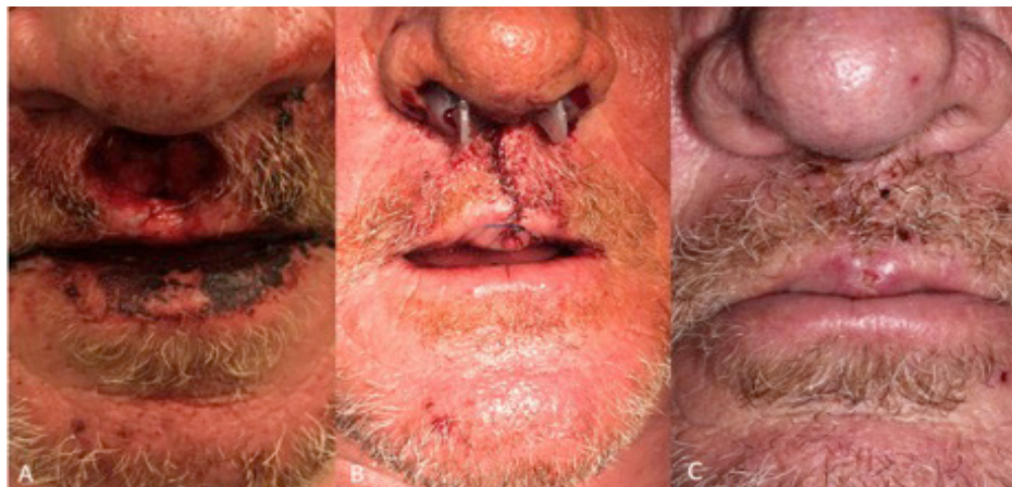
Figure 1. A. excisional blast injury to philtrum. B. Philtrum and nares after surgical repair and packing by oral maxillofacial surgery. C. Well healed wound at follow-up visit.

Management of injuries sustained from EC explosions should be approached from the standpoint of addressing both