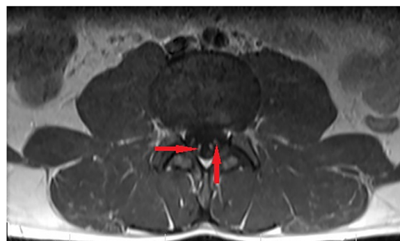
Fig. 2. T1-weighted axial MRI with contrast view of the lumbosacral region in which root enhancements are pointed with arrows.

ago were positive too. But they have shown no neurological symptoms.