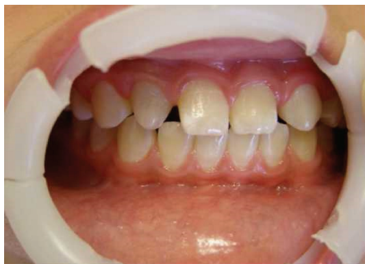
FIGURE 4: Clinical photography of maxillary right lateral incisor at the twenty-month follow-up appointment.

long-term retention. Therefore, pulp regeneration is the ideal treatment for the presented case.