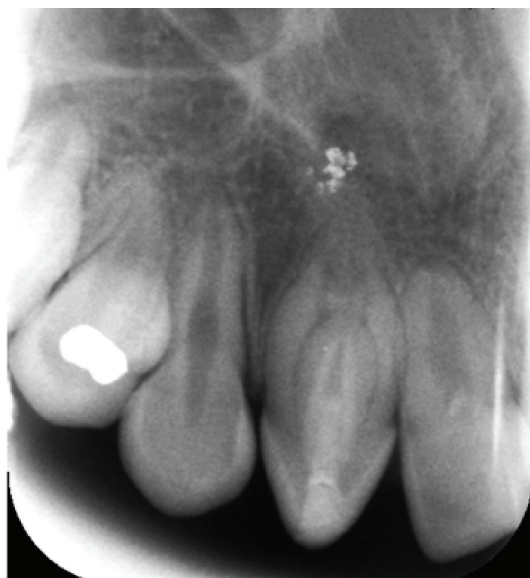
FIGURE 2: The one-year follow-up radiograph showing complete healing of the periapical lesion.

gingiva was swollen. So, as a further step, triantibiotic paste (a creamy paste made of equal proportions of ciprofloxacin, metronidazole, and minocycline mixed with sterile water) was placed into the canal. One month after the antibiotic treatment, the tooth was asymptomatic.