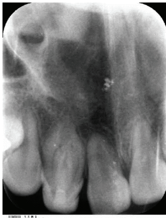
FIGURE 3: The twenty-month follow-up radiograph showing that the open apex was closed.

The one-year follow-up showed no clinical signs of pathology. Radiographic examination revealed complete healing of the periapical lesion, but apical closure was not observed (Figure 2). The tooth had a negative response to vitality testing. The vital pulp tissue in the invaginated canal had been removed during instrumentation; however, the main root canal was not exposed, the tooth had a negative response to vitality testing postoperatively, and the periapical lesion resolved. So we assume that it was a peri-invagination lesion. At the twenty-month examination, the control radiograph showed successful apical closure (Figure 3). At this follow-up examination, the tooth had a negative response to vitality testing.