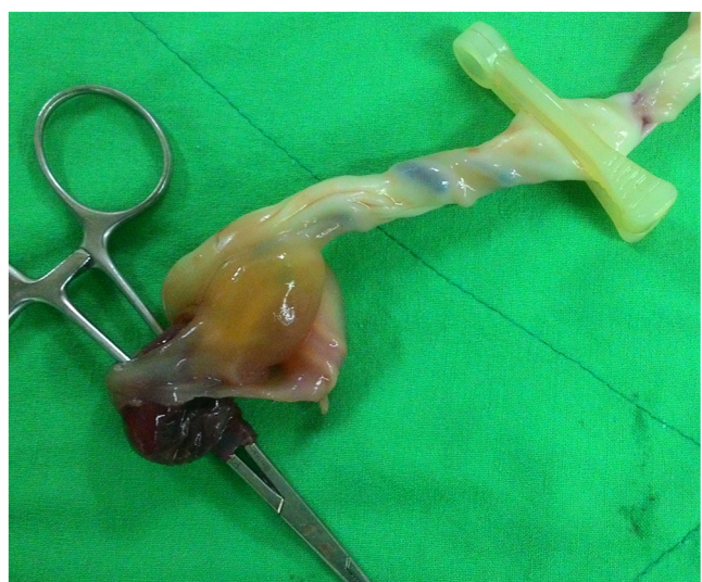
Fig. 3. The internal opening of VF probed using a mosquito forcep.