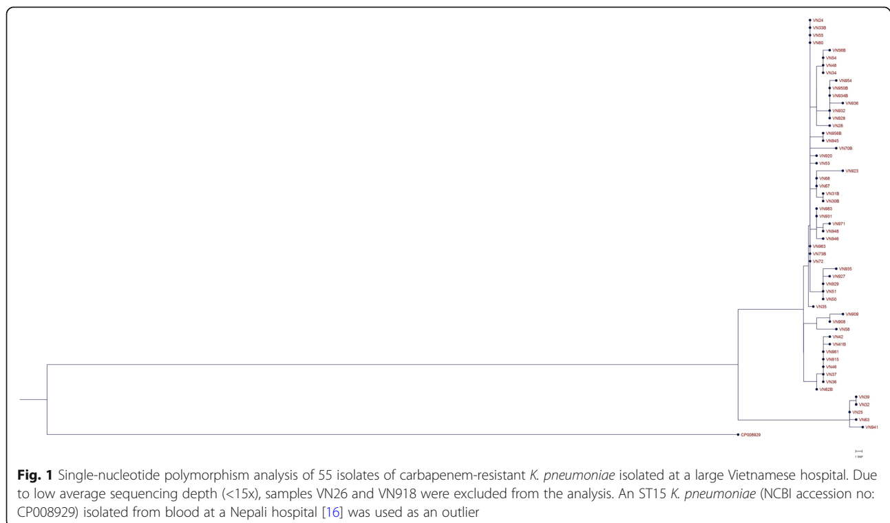
Fig. 1 Single-nucleotide polymorphism analysis of 55 isolates of carbapenem-resistant K. pneumoniae isolated at a large Vietnamese hospital. Due to low average sequencing depth (<15x), samples VN26 and VN918 were excluded from the analysis. An ST15 K. pneumoniae (NCBI accession no: CP008929) isolated from blood at a Nepali hospital [16] was used as an outlier

Susceptibility rates were highest for the antibiotics ceftazidime/avibactam (96%) and gentamicin (91%).