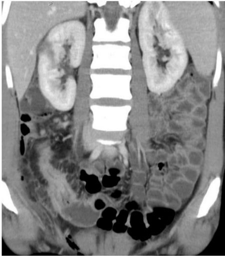
Fig. 1. Abdominal CT scan revealed an inflammatory thickening of the last ileal loop with, multiple fistulas and a collection of 3 cm. Moreover, at the mediorenal part of the right kidney, there was a well-defined and hypodense lesion measuring 2, 5* 3 cm.