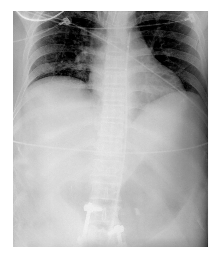
Fig. 1. Radiograph of resuscitative endovascular balloon occlusion of the aorta.

scending thoracic aorta, we inflated the balloon with normal saline (Fig. 1). After occlusion of the aorta, the SBP abruptly increased from 57 to 108 mmHg, and the patient could be transferred to the vascular intervention room. The REBOA was inflated for 15 minutes and deflated gradually during angiography. After removal of the REBOA, his vital signs remained stable for several hours. Angiography did not detect the active arterial bleeding site and the patient was admitted to the intensive care unit. Esophagogastroduodenoscopy was performed in the intensive care unit, and a Dieulafoy ulcer and duodenal varix without active bleeding were detected in the second part of the duodenum. The Dieulafoy ulcer was clipped by hemoclips and duodenal varix embolization was performed. Although vital signs remained stable under vasopressor treatment, hemoglobin levels decreased continuously, and transfusion was needed during the admission period. The bleeding source was still obscure; hypovolemic shock and cardiac arrest occurred 24 hours after admission to the ED. A total of 19 packed red blood cell units were transfused until cardiac arrest. We tried to resuscitate the patient with cardiopulmonary resuscitation, but failed.