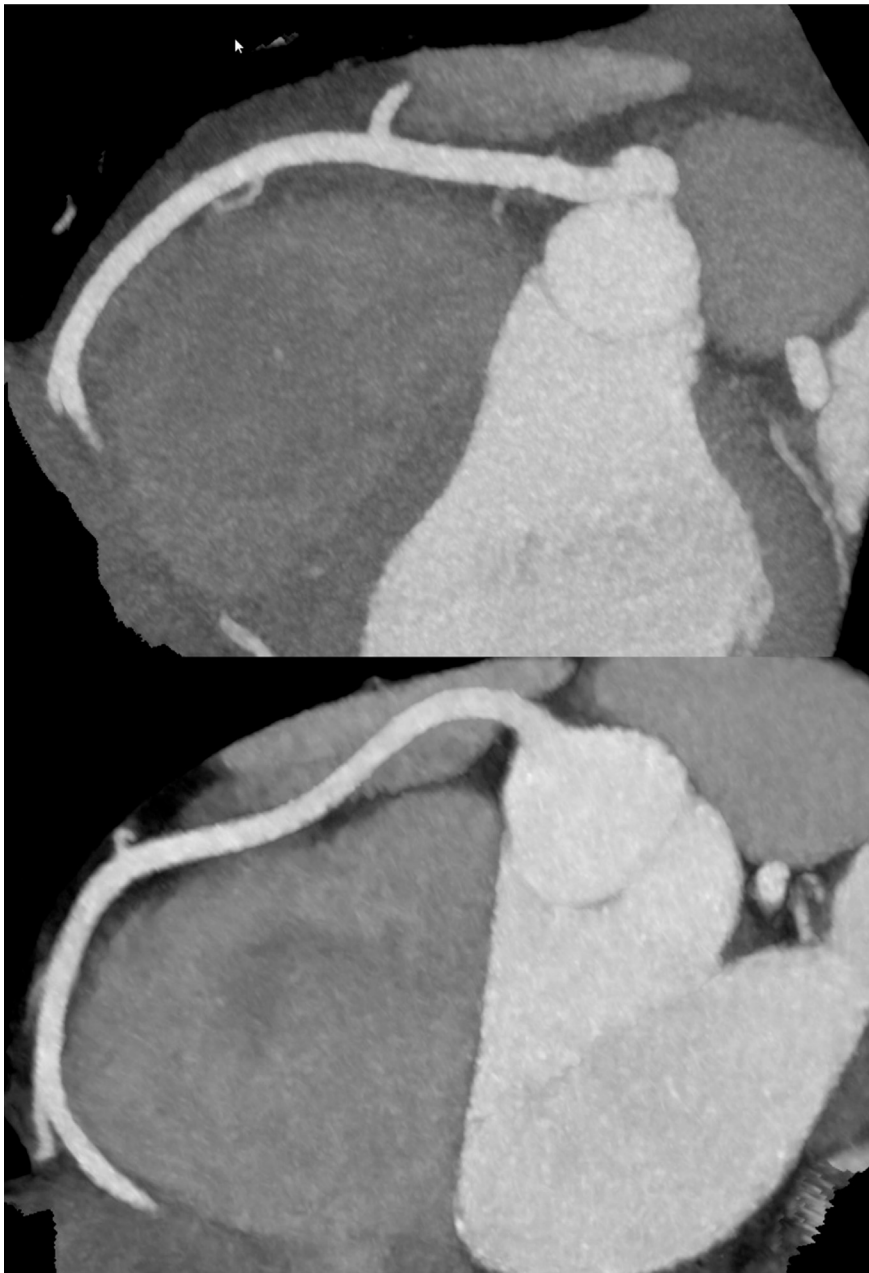
Fig. 2. Representative 5 mm MIP images of the RCA from ultra low dose (top image) and control (bottom image) groups.