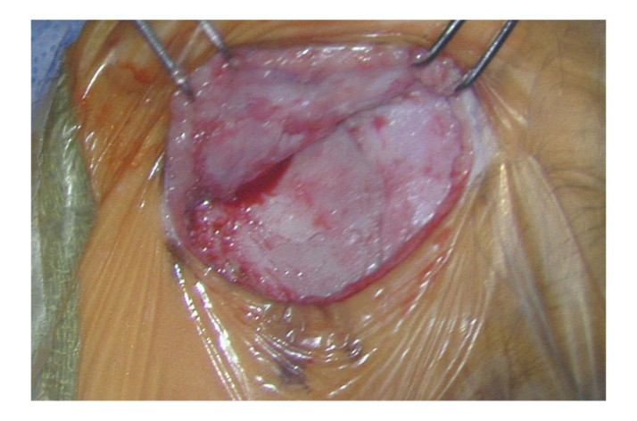
FIGURE 2 Offset periosteal and skin incisions. View is angled superiorly

surgical intervention; minor surgical complications include skin infection, hematoma, and other problems that can be managed with conservative management and do not threaten the device.<sup>35-37</sup> Despite distinct anatomic and physiologic factors, the majority of studies reveal that CI surgery in young infants is both safe and surgically feasible. In a prospective study examining 300 CI recipients ages 1-5 years with an average follow up duration of 4 months, Bhatia et al reported an overall rate of 2.35% and 16% for major and minor complications, respectively. The authors described a trend towards increased complications in