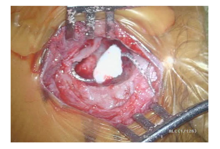
FIGURE 5 Coiled array in small mastoid, held in place with absorbable gelatin sponge

<12 months compared with 3.2% for infants 12-18 months (P = 1.0).<sup>38</sup> In a similar large retrospective review of 1278 patients from the ACS-NSQIP database, Kalejaiye et al showed no significant differences in complication rates (2.73% vs 1.48%, P = .96) when comparing CI recipients <12 months (n = 73) to those >12 months.<sup>39</sup> Patients <12 months were noted to have longer mean operative times (191 minutes vs 160 minutes, P = .0015), which may be attributed to smaller skull size and less developed mastoid cavity with more bone marrow. Due to thinner skin flaps in very young infants, there have been concerns about increased risks of soft tissue complications including skin breakdown.<sup>37</sup> However, Kalejaiye et al reported a soft tissue complication rate of 1.33%, which is comparable to other reported rates in the literature.<sup>35,39-41</sup>