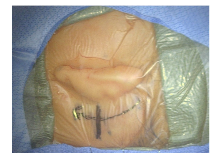
FIGURE 1 Postauricular incision marked out. Marked level of bony external auditory canal is approximately 1/3 superior from the palpated mastoid tip

Surgical and anesthetic safety in very young children were initially perceived as an obstacle to CI in this population; recent literature has investigated and described both safety and logistical considerations in implanting children <12 months of age, resulting in the long-awaited reduction in approved age by the FDA.