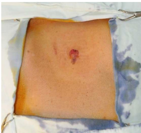
Fig. 1. Preoperative photograph. A firm, brown-to-reddish skin nodule with discoloration was observed on the posterior neck.

brown-to-reddish skin nodule about 10 mm in diameter with an erosive dimple on the upper portion (Fig. 1). There was no other abnormality of other organs and systems. The patient also had no significant past medical history. Under local anesthesia, the nodule was completely excised with a 5-mm free margin.