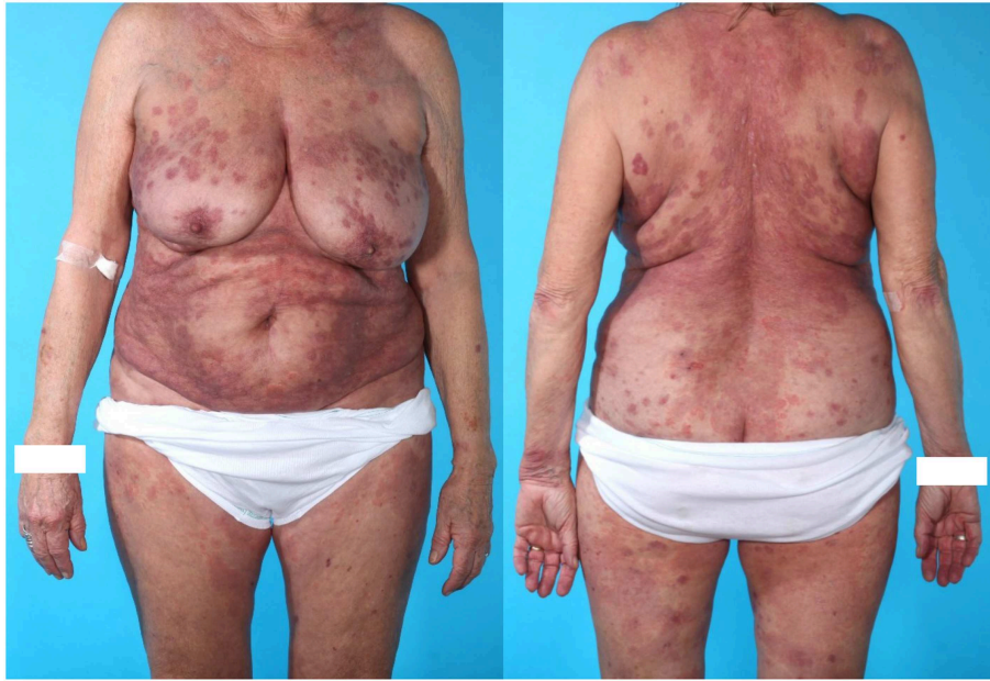
FIGURE 2 | Seventy six years old (at diagnosis of PV) ethnically danish woman with mucocutaneous PV, celiac disease, and former dermatitis herpetiformis as well as essential hypertension. The patient did not receive treatment with ACE inhibitor. Skin biopsy showed acantholysis. DIF on the skin biopsy showed intercellular deposition of IgG. The patient was treated with oral prednisolon, Methotrexate and two times Rituximab. Time to remission was 20.7 weeks which is close to mean time to remission (19.9 weeks) in the 19 included patients. The patient received a total dose of 2,495 mg prednisolone, which placed her in the “low dose prednisolone” group. This patient was later diagnosed with osteoporosis on DXA scan.

We attempted to determine the severity of PV disease by calculating PDAI based on information from the patient record (11). The ability to perform precise PDAI ranging was difficult. In a few cases, the clinician had thoroughly described size, number, and placement of the blisters. But in the vast majority, the information lacked precise details on location and total number of the blisters. In particular, blisters in the oral cavity were not described as located to a particular region of the oral cavity. This complicated the ranging of patients according to the PDAI and may possibly have underestimated the real PDAI score. In a prospective study, clinicians can be educated to register objective findings and comorbidities precisely so that the clinical data can be used in research.