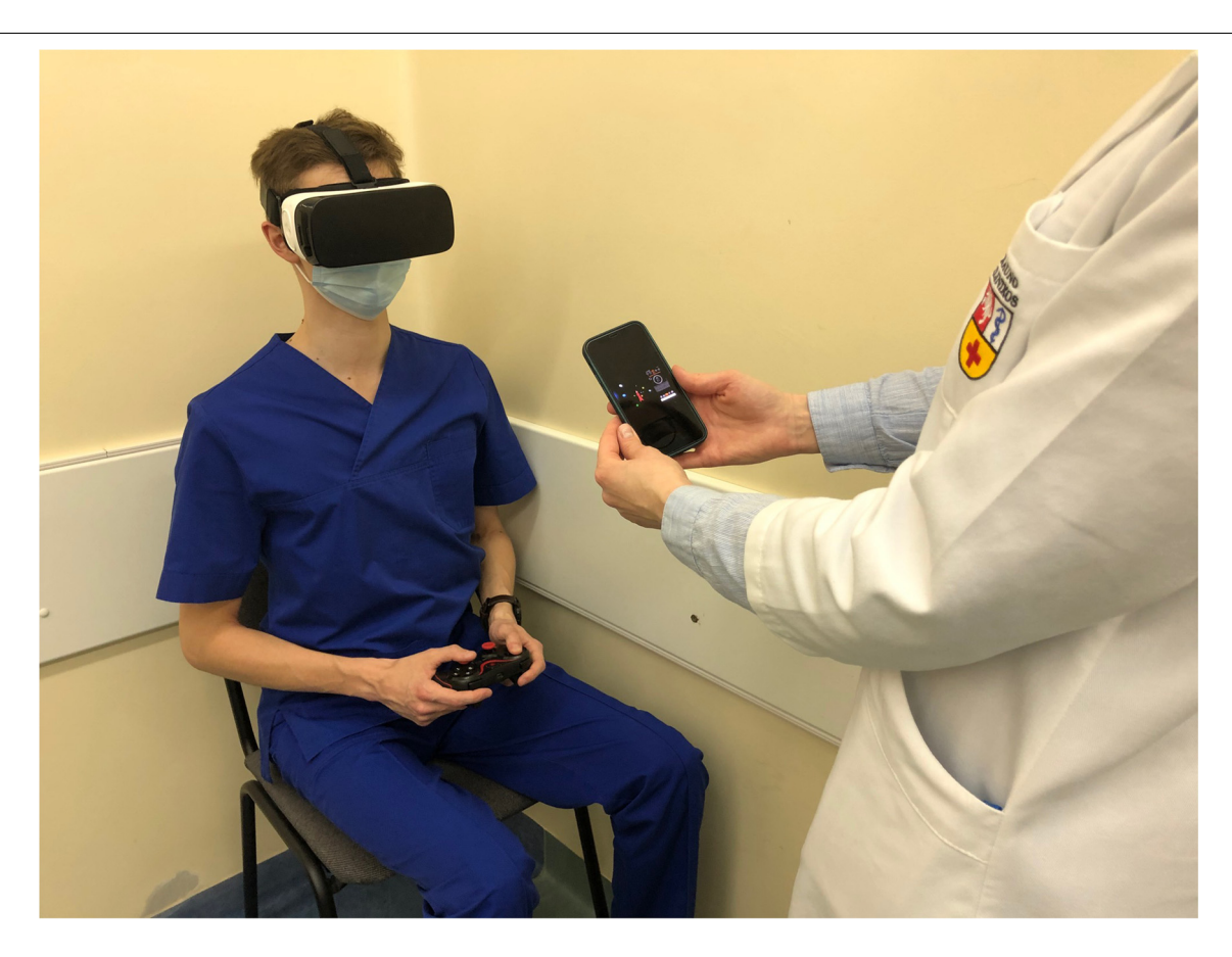
FIGURE 1 | Testing with the VIRVEST system (consent statement obtained).

system enables us to observe a 3D stimulus presented across three separate conditions: a static SVV, a dynamic clockwise SVV, and a dynamic counter-clockwise SVV. The virtual reality environment is controlled by the participant using a Bluetooth-connected gamepad (Ulozienė et al., 2017).