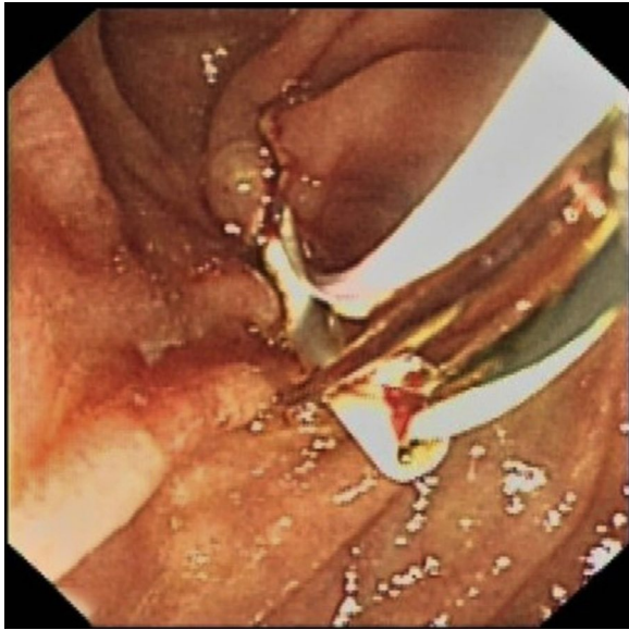
Fig. 2 The first PBS was inserted into the right or left hepatic duct through the endoscopic channel with the assistance of a stent delivery catheter, meanwhile, the fishing line at the distal end of the first PBS could be observed under endoscopy