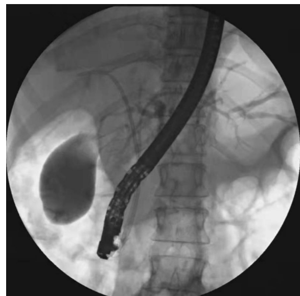
Fig. 4 Two PBS were successfully implanted in the left and right hepatic duct

The stent migration rate, technical success rates, times of stent migration, adverse events, and procedures time between two groups were evaluated in this study. Proximal migration was defined as when stent was observed in the duct on fluoroscopy and the distal end of the stent was not observed under endoscopy. Distal migration was defined as when stent located below the original position or was not observed under either endoscopy or fluoroscopy. Technical success was defined as the placement of all stents over the stricture location, the distal end of the stent in the intestinal cavity is almost flush and constraint medium