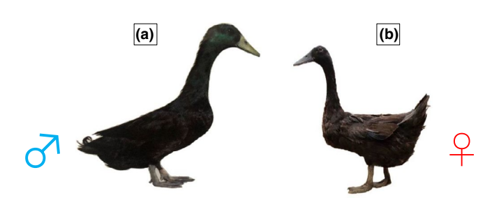
FIGURE 1 Leizhou Black Duck at 180 days old; (a) male, (b) female

Therefore, this research focused on the breeding of two generations (0 and 1) of Leizhou Black Ducks using family breeding selection method. This was done to analyse the growth performance,