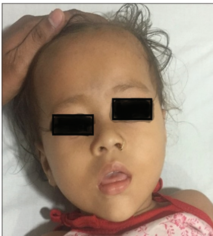
Figure 3: Abnormally high hairline on the forehead