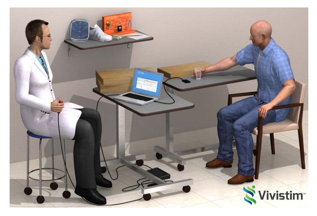
Figure 1. Schematic of vagus nerve stimulation device use in a typical therapy session.

with the Stroke Application Programming Software was used to program the IPG and initiate VNS. The stimulation was manually triggered by the therapist using a push button, while the patient performed a task (Figure 1). Stroke Application Programming Software allows the therapist to control the relative timing of stimulation to therapy exercises using the push button. The software also allows the physician to program the stimulation parameters (amplitude [mA], frequency [Hz], pulse width [µS], and duration [ms]), captures patient programming history, and checks lead impedance and battery status. A 500-ms burst of VNS was delivered to the VNS group during each movement (the rehabilitation-only group did not have a device implanted). Each simulation consisted of fifteen 0.8-mA, constant current, charge balanced pulses (100µs pulse width, 30-Hz frequency). These stimulation parameters grew out of hypothesis-driven research in humans and animal models,10-14 including studies of cortical map plasticity and electroencephalogram desynchonization using VNS.12 Note stimulation was only delivered to the left vagus nerve to avoid activation of the sinoatrial node (which is innervated by the right vagus nerve), but bilateral neuronal connections mean stimulation should affect both cerebral hemispheres. Full details are given in the Methods in the online-only Data Supplement.