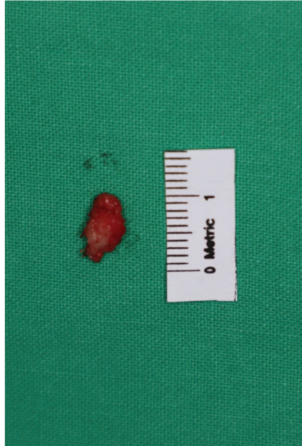
Figure 3. Surgical specimen.